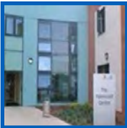
Halewood Health Centre