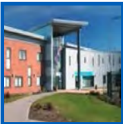
Towerhill Primary Care Resource Centre